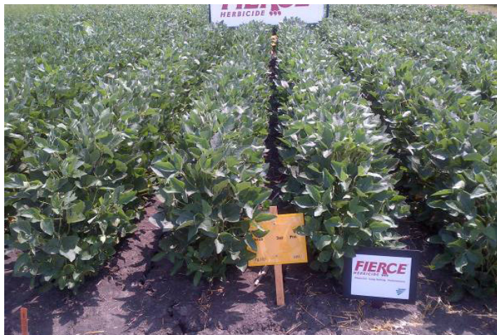
Fierce 3 oz/A—56+ Days After Treatment (equivalent to Fierce EZ 6 fl oz/A)