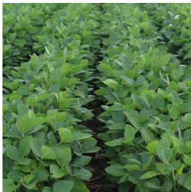
Fierce 3 oz/A (equivalent to Fierce EZ 6 fl oz/A)