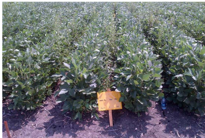
Authority® XL 5 oz/A—56+ Days After Treatment