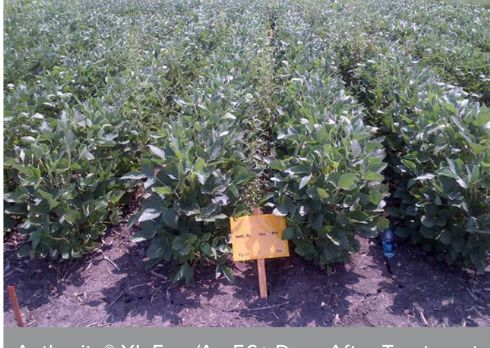
Authority® XL 5 oz/A—56+ Days After Treatment