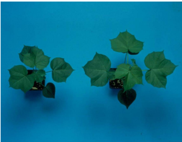
Photos taken 14 days after treatment